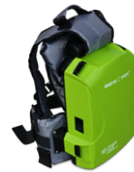
EDD 10X Battery Backpack