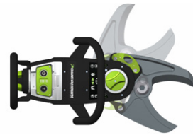
With P4w CUTTER