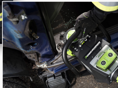
Patented Rotating Powerhead

The rotating Powerhead of the P4 enables spreading and cutting in tight spots and around corners. In other words, places other rescue tools just cannot go!