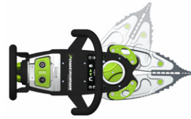
With P4x SPREADERS